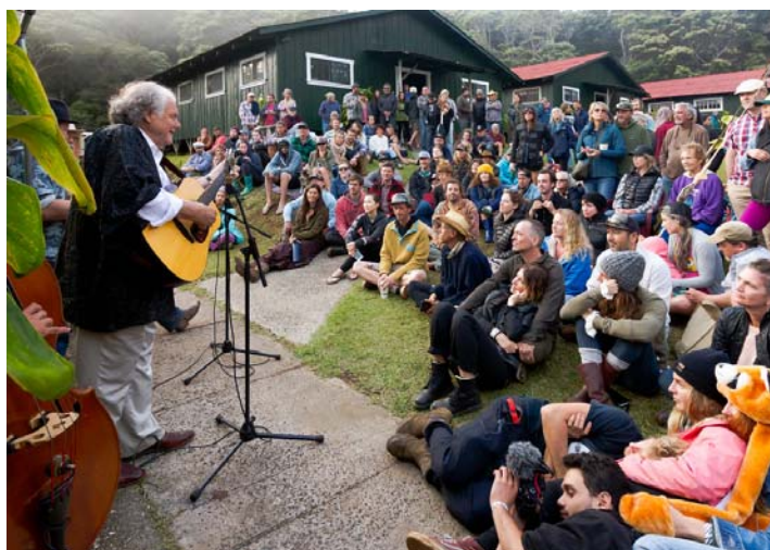
Peter Rowan at Kauai Old Time Gathering, Nov. 2018

format of our festival (free admission, week-long with only one guest artist, anyone can perform a 15 minute set, 100% volunteer and membership supported) people couldn't believe it could exist! And not only does AFF exist, but we are going strong in our 46 th year!!