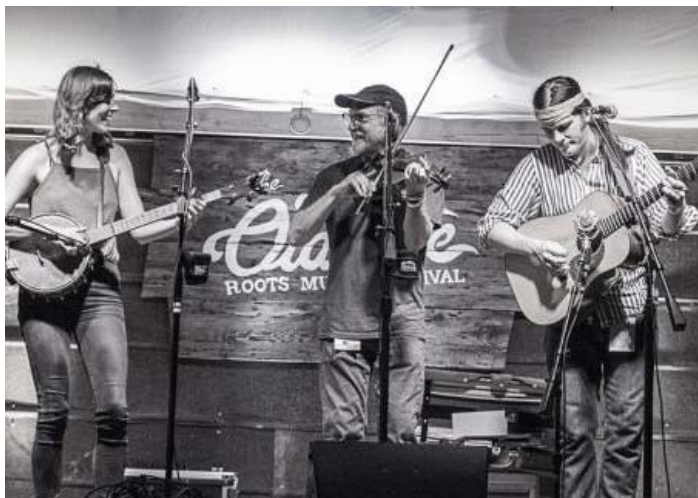
Molsky's Mountain Drifters—OldTone Festival

Each of these festivals was fantastic in its own way. In its second year, Kauai Old-Time was small and intimate, offering the opportunity to (literally) sit at the feet of Peter Rowan in a tropical paradise as he sang old favorites and new songs alike. Fiddle Tunes is a huge, week-long music camp with an unrivaled focus on teaching and workshops from the best living fiddlers. OldTone is a weekend festival showcasing musicians playing the original 'old-school' styles of roots music, without the modern polish that happens when they blend in the realm of 'popular music'.